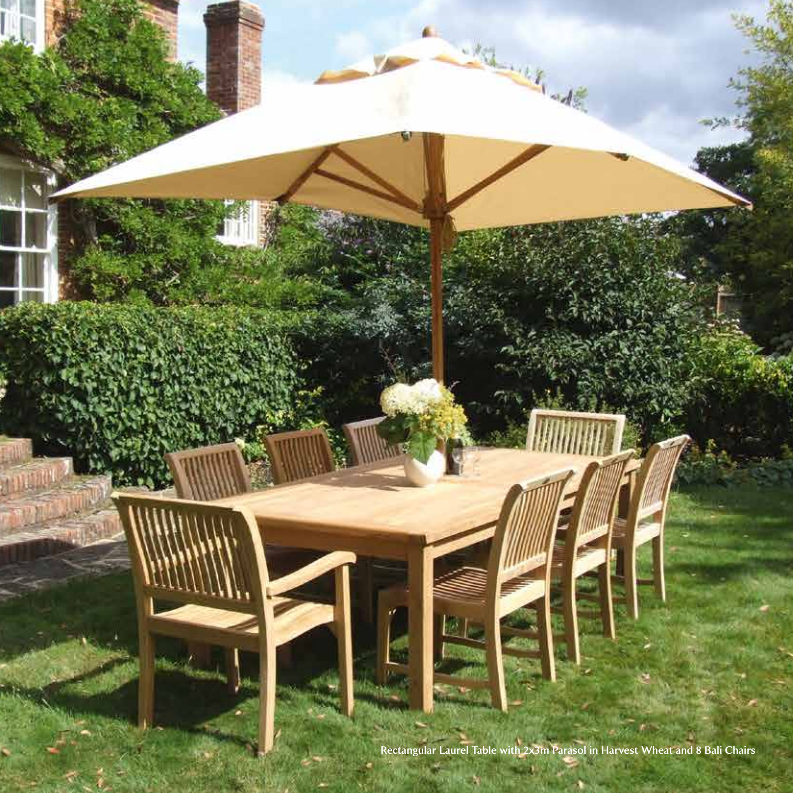
Rectangular Laurel Table with 2x3m Parasol in Harvest Wheat and 8 Bali Chairs