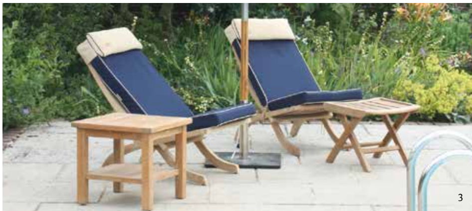
1 - Steamer Cushions - 49x183x8cm - Available in 5 colours 2 - Lounger Cushions - 60x198x8cm - Available in 5 colours 3 - Seat pad with Back Cushions - 42x96x5cm - Available in 5 colours