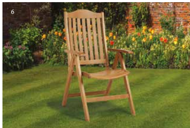
1 - Stackable Pool Lounger 2 - Joseph Pool Lounger 3 - Traditional Steamer with Wheels 4 - Adirondack Lounger 5 - Adirondack Folding Lounger 6 - Lymington Reclining Chair