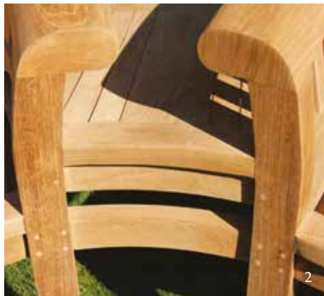
1 - Crescent Bench - 170cm, seats 3 people 2 - Companion Seat - 150cm, seats 2 people 3 - Love Seat - 150cm, seats 2 people