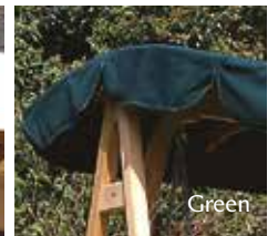
4 - Sumba Swing Bench with awning - Available in 2 colours of awning - see inset