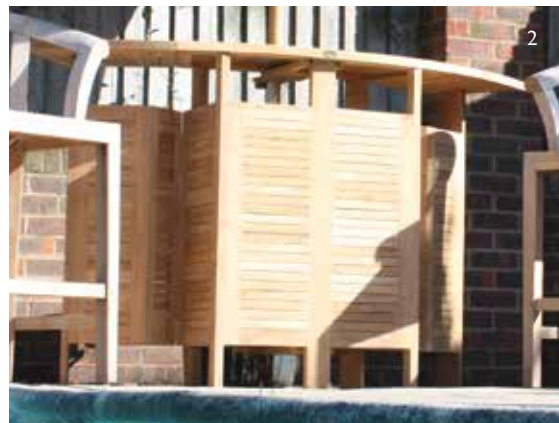
1 - Round Bar Table - 90cm Diameter, seats 2 people - shown with our Natural Bar Stool 2 - Folding Bar Table - 40x100-180cm, seats 4 to 6 people