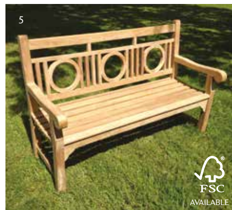
1 - Riverbank Bench - Available in 4 sizes and a corner bench 2 - Sumba Bench - Available in 3 sizes 3 - Sharcott Bench - 185cm, seats 3 people - Designed by Michael Balston 4 - Grafton Bench (shown with our Grafton Coffee Table) - 248x100cm, seats 6 people 5 - Winchester Bench - Available in 3 sizes, available with either flat or classic arms