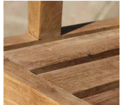
3 - Crescent Bar Table - 80x112cm, seats 2 to 4 people - Shown with Luxury Crescent Bar Chair 4 - Club Bar Chair - Available with and without arms