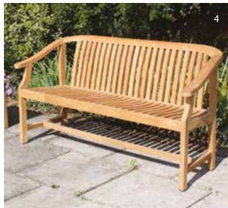
1 - Imperial Bench - Available in 3 sizes - Reclaimed Teak 2 - Bali Bench - Available in 3 sizes 3 - Javanese Bench - Available in 3 sizes 4 - Club Bench - Available in 3 sizes