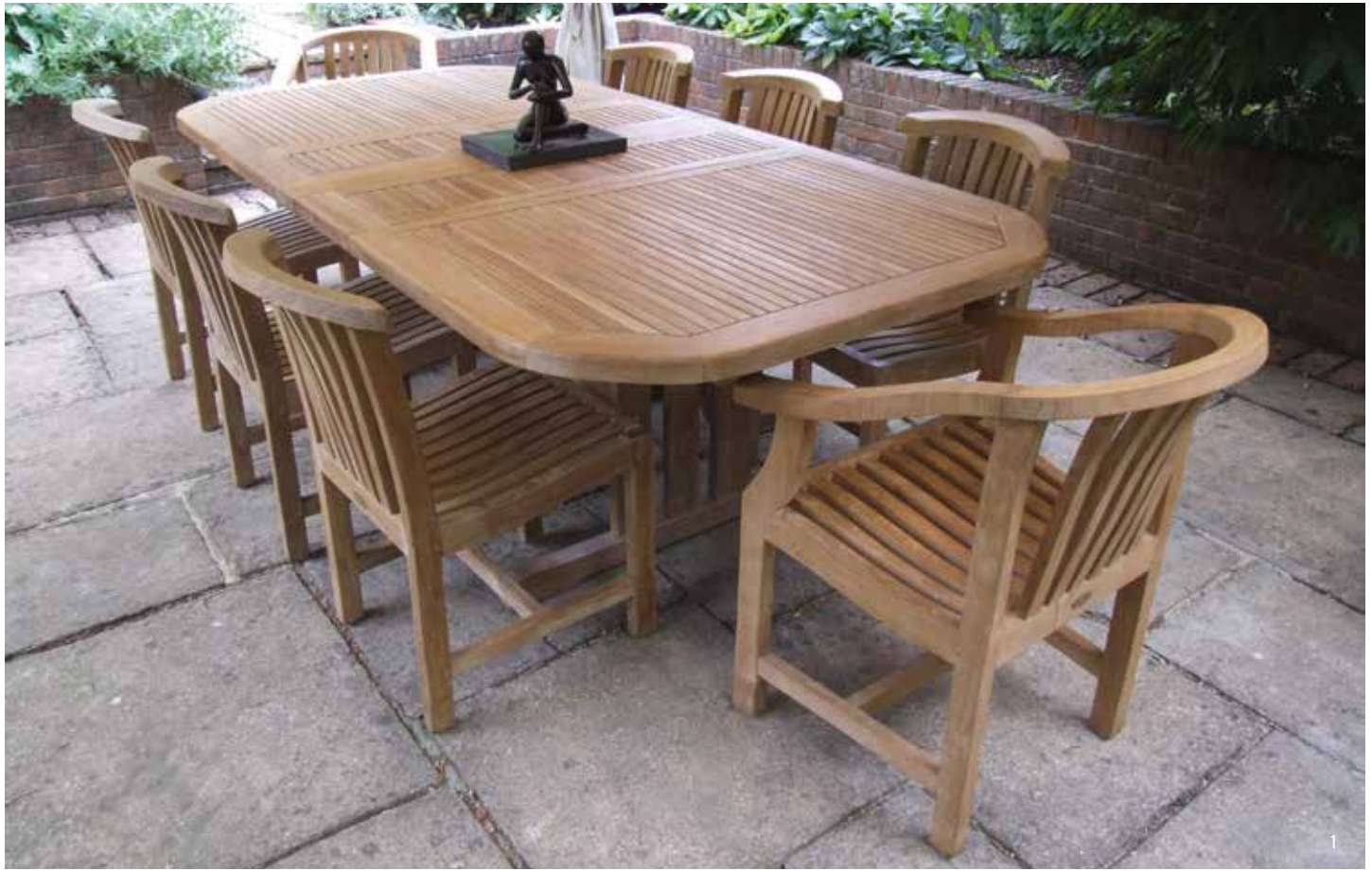
1 - Deluxe Rectangular Extending Table - Available in 5 sizes, seating 6 to 14 people - shown with 8 Club chairs