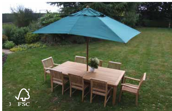
1 - Round Bamboo Parasol - Available in 3 sizes 2 - Square Bamboo Parasol - Available in 3 sizes 3 - Rectangular Bamboo Parasol - Available in 2 sizes Items 1-3 available in Polyester or Spuncrylic in a range of colours. See website for details.